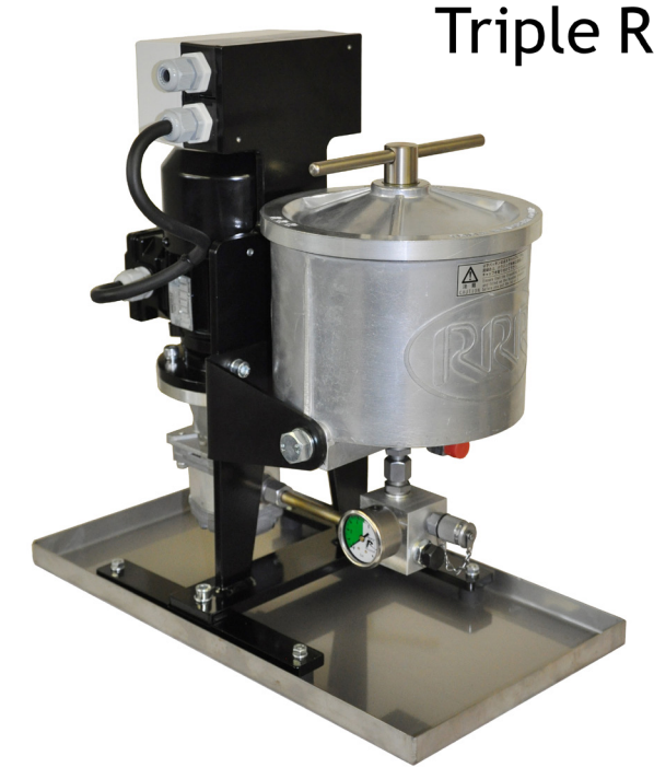
SE100E-BH with optional leakage tray